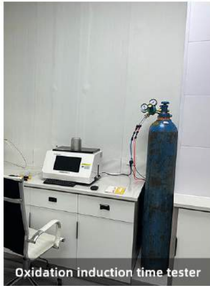
Oxidation induction time tester