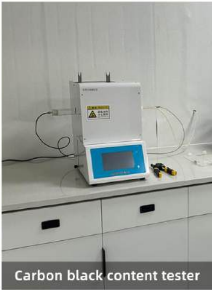
Carbon black content tester